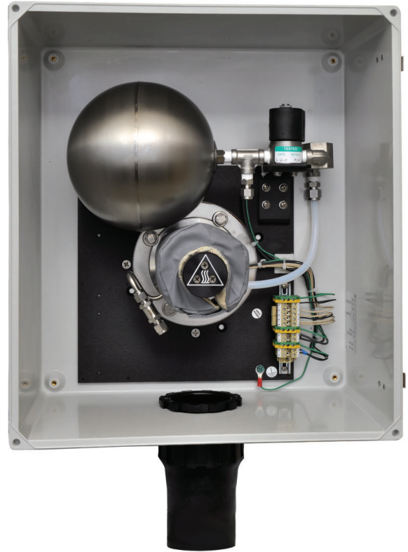
Shown with most common options