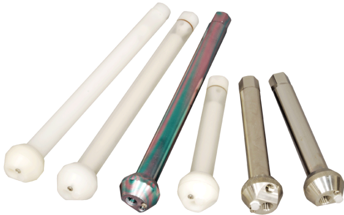
Available in: Stainless Steel, Kynar/Glass, Kynar/Kynar, Hastelloy C-276